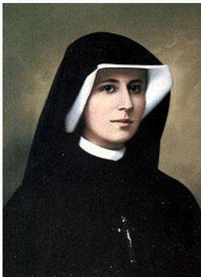
Saint Maria Faustina Kowalska

Saint Faustina was born Helena Kowalska in a small village west of Lodz, Poland on August 25, 1905. She was the third of ten children. When she was almost twenty, she entered the Congregation of the Sisters of Our Lady of Mercy, whose members devote themselves to the care and education of troubled young women. The following year she received her religious habit and was given the name Sister Maria Faustina, to which she added, "of the Most Blessed Sacrament", as was permitted by her congregation's custom. In the 1930's, Sister Faustina received from the Lord a message of mercy that she was told to spread throughout the world. She was asked to become the apostle and secretary of God's mercy, a model of how to be merciful to others, and an instrument for reemphasizing God's plan of mercy for the world. It was not a glamorous prospect.